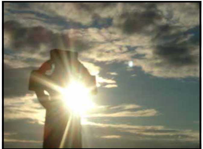
The longest day in County Claire in Ireland A beautiful picture of the sun glistening behind a cross.