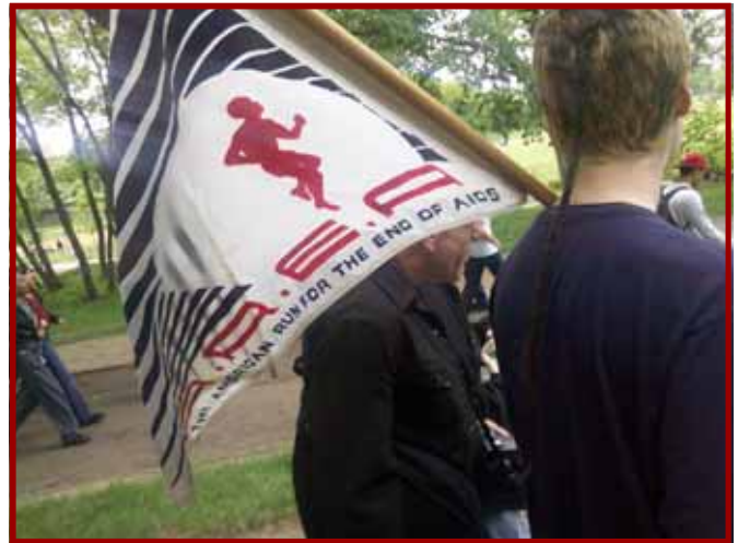
AREA Aids Walk Flag 2009

through your contributions to our AIDS Walk team. We receive more than just financial support through the AIDS Walk. At a time when AIDS awareness in America has eroded to a dismayingly low level, we need the encouragement, activism and sense of a united community that the AIDS Walk provides now more than ever.